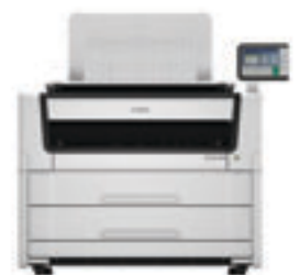
PlotWave 5000/5500 printing systems