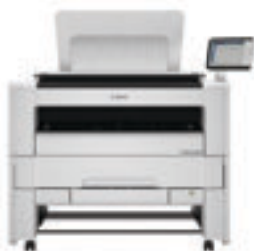
PlotWave 3000 series

Printing from many locations and sources is supported by the PlotWave series. With Publisher Mobile, you can preview and print files from your mobile phone or tablet. With Publisher Express, you can submit print files directly from the web. Driver Select, the printer driver for Windows, helps reduce errors and supports first-time-right results, with its clear and easy-to-use functionality. Driver Express enables printing PostScript files from Mac and Windows.